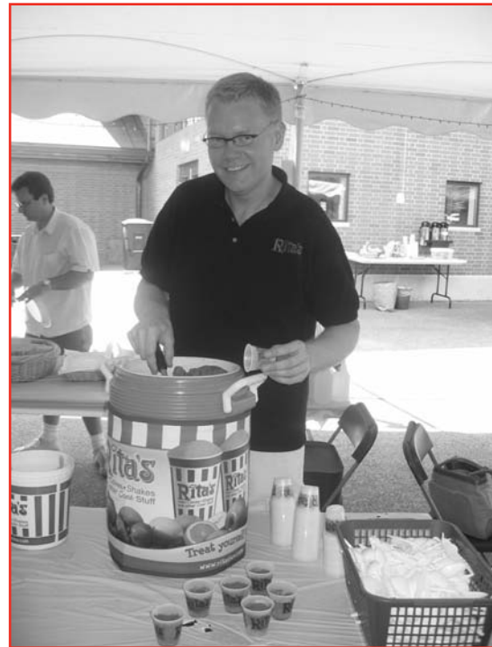
Smiling Representatives from Rita's Italian Ice helped to serve donated "cool stuff".